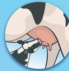
The amount of teat sealant present after calving can vary. Some may be lost if a calf sucks