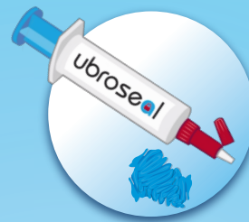
Actual volume of one Ubroseal syringe